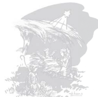
3. Canción de cuna pág. 4