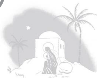
8. Dondorondón pág. 9