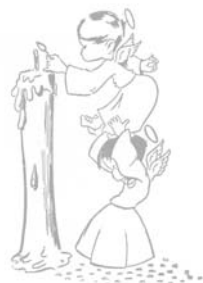
1. ¡Pastores, venid! pág. 2