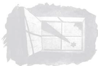
4. Noche de paz pág. 5