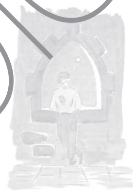
6. El pobre alegre pág. 7