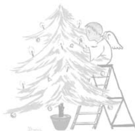
2. El abeto pág. 3