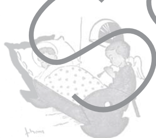
7. Non, non pág. 8