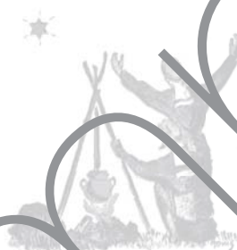
5. Adeste fideles pág. 6